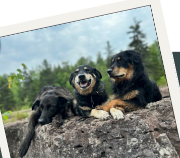
Bear, Bandito, + Butters